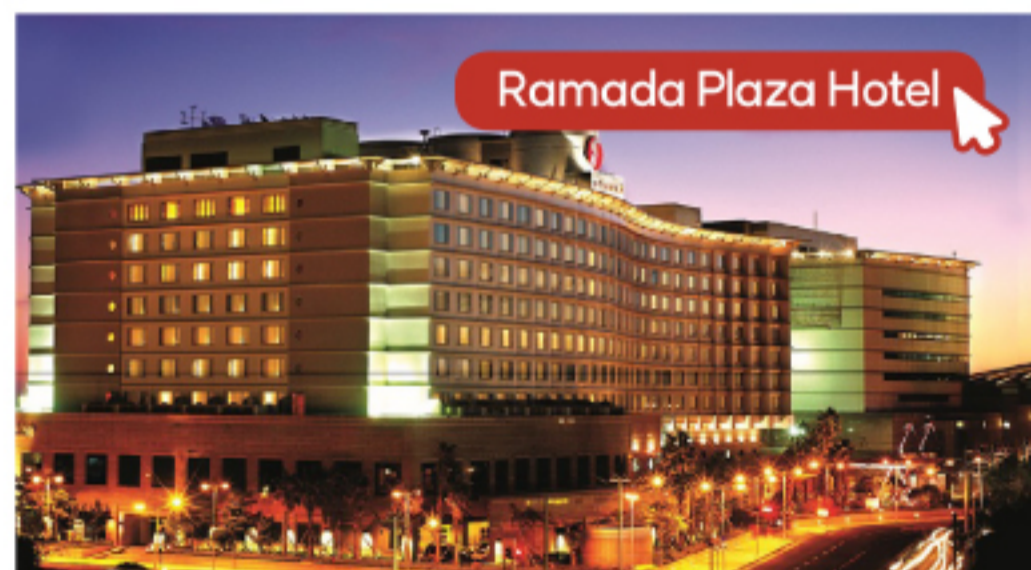
Ramada Plaza Hotel